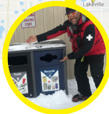
Buck Hill Ski & Snowboard Area, Burnsville