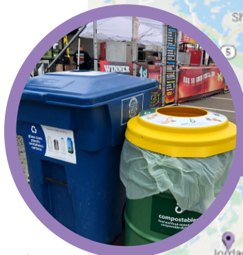
Mystic Lake Rib Fest, Prior Lake