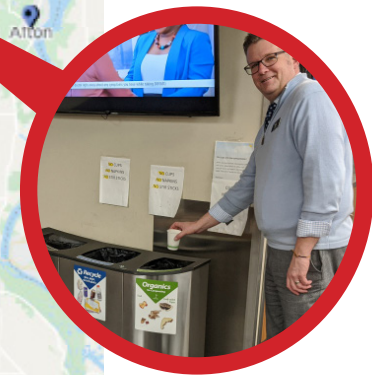
Maplewood Toyota, Maplewood