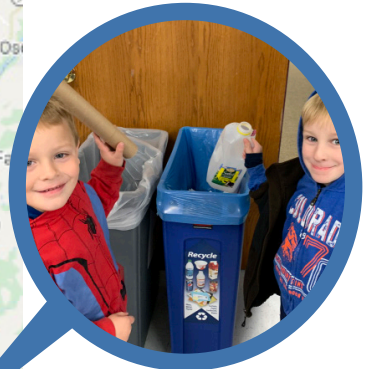
St. Croix Kids Early Childhood Center, Stillwater